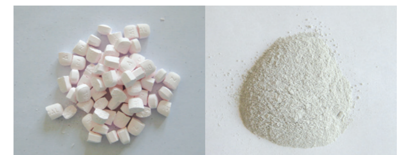
Different tablets and pharmaceutical raw materials