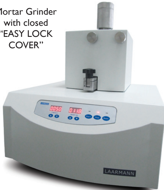
Mortar Grinder with closed “EASY LOCK COVER”