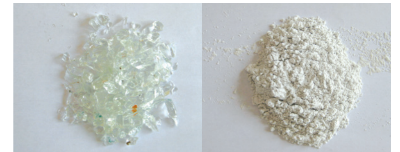
Brittle materials such as glass