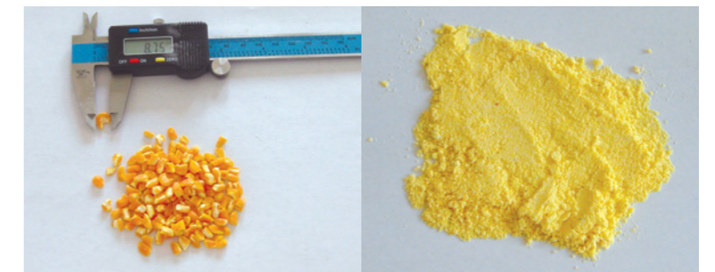
Different food stuff such as maize, grain etc.